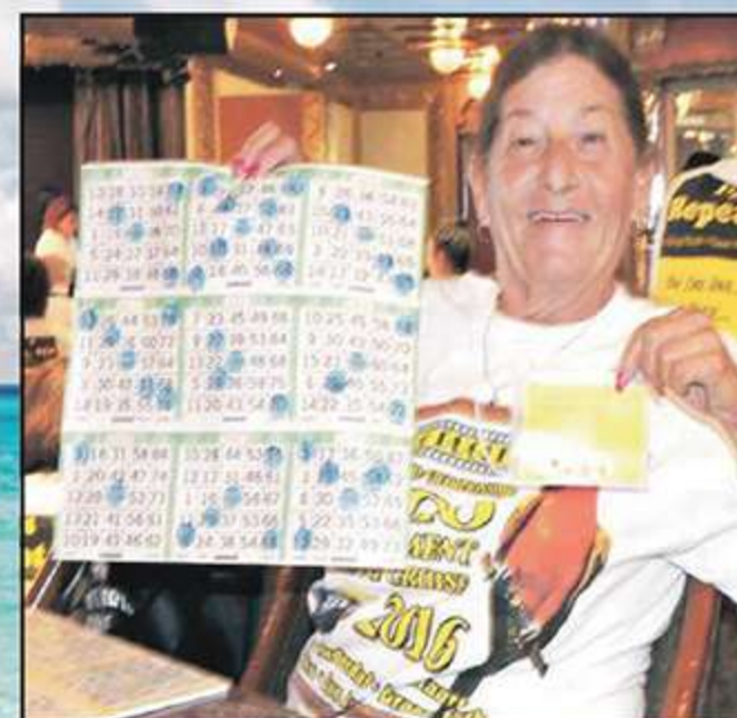
SAILING FROM ORLANDO, FL.