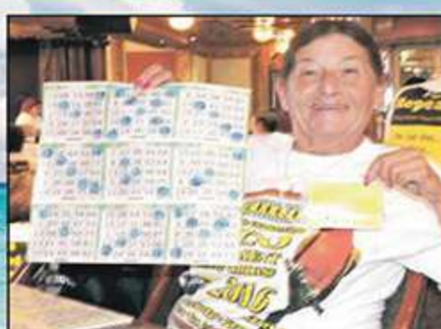
SAILING FROM ORLANDO, FL.