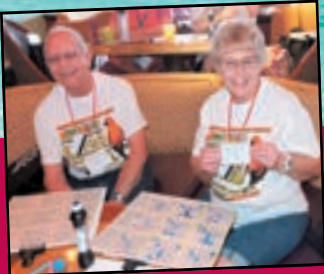
SAILING FROM NEW ORLEANS, LA.

THIRTY FIVE YEARS of experience guarantees that the Bingo Bugle knows just how to bring you the best of Bingo. Our courteous, friendly and experienced staff members offer early-bird Bingo and special games in addition to the World Championship Tournament games.