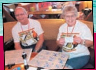
SAILING FROM NEW ORLEANS, LA.

THIRTY FIVE YEARS of experience guarantees that the Bingo Bugle knows just how to bring you the best of Bingo. Our courteous, friendly and experienced staff members offer early-bird Bingo and special games in addition to the World Championship Tournament games.